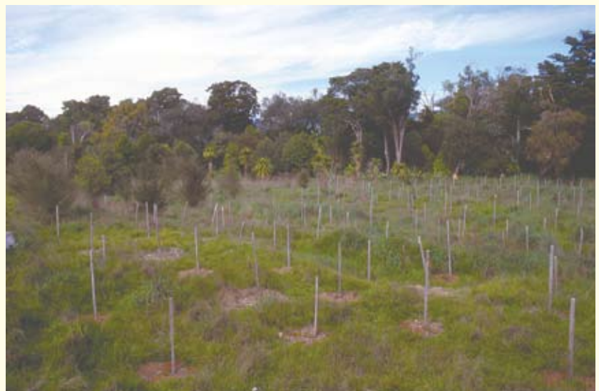
Early stages of revegetation