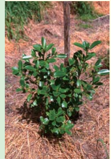
Strongly growing plant showing excellent weed control